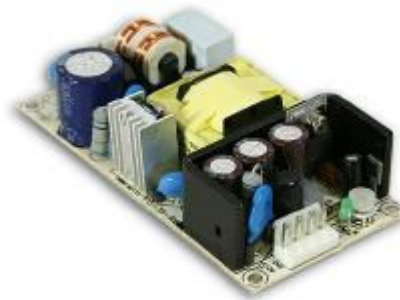
Size 101.6 x 50.8 x 24 mm