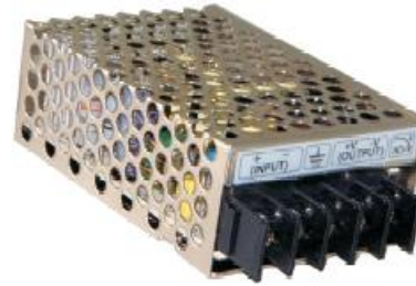
Size 79 x 51 x 28 mm