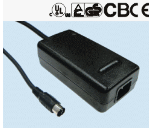
Size 147 x 76 x 43mm