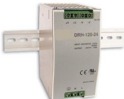
DRH-120 Single Phase 340-550 VAC Input 24 & 48 VDC Output 120 Watts