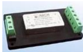
Encapsulated DC-DC Converters Compact DC-DC Converters 15 ~ 40 Watts, Single, Dual & Triple outputs DIN Rail Mounting Kits Available