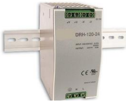
DRH-120 Single Phase 340-550 VAC Input 24 & 48 VDC Output 120 Watts