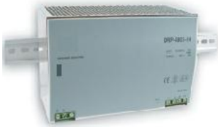
DRT-240, 480 & 960 Series 240 to 960 Watts, 24 & 48 Volt outputs 3 Phase Input ~ 340-550VAC