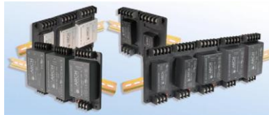
Encapsulated Power Supplies 5 ~ 40 Watts, Single, Dual & Triple outputs DIN Rail Mounting Kits Available