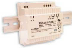
DR-15, 30, 60 & 100 Series 15 to 30 Watts, 5, 12, 15, and 24 Volt output versions Shallow 56mm depth