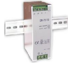
DR-75, 120, 240 & 480 Series, 75 to 480 Watts, 12, 24 & 48 Volt output versions