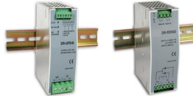
DC-UPS & RDN Modules Battery back-up & redundancy units For use with DR, DRP & DRT PSU's