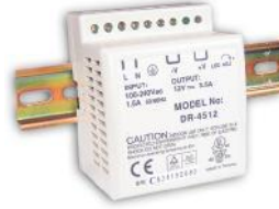
DR-45 Series 25 to 48 Watts, 5, 12, 15 and 24 Volt output versions