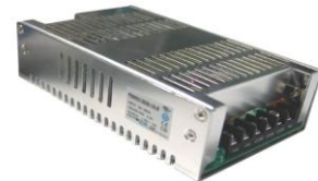
Chassis Mounting Units From 5 to 3000 Watts DIN Rail Mounting Kits Available