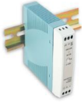
MDR-10, 20, 40, 60 & 100 10 to 100 Watts, 5, 12, 15, 24 & 48 Volt output versions Extra slim 22.5 to 55mm wide