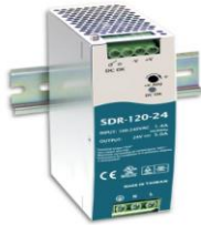
SDR-120, 240 & 480 Series Ultra Slim 120, 240 and 480 Watts 12, 24 or 48 Volts output