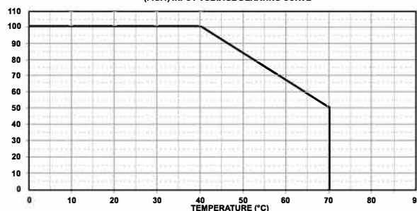
(FIG.2) TEMPERATURE DERATING CURVE